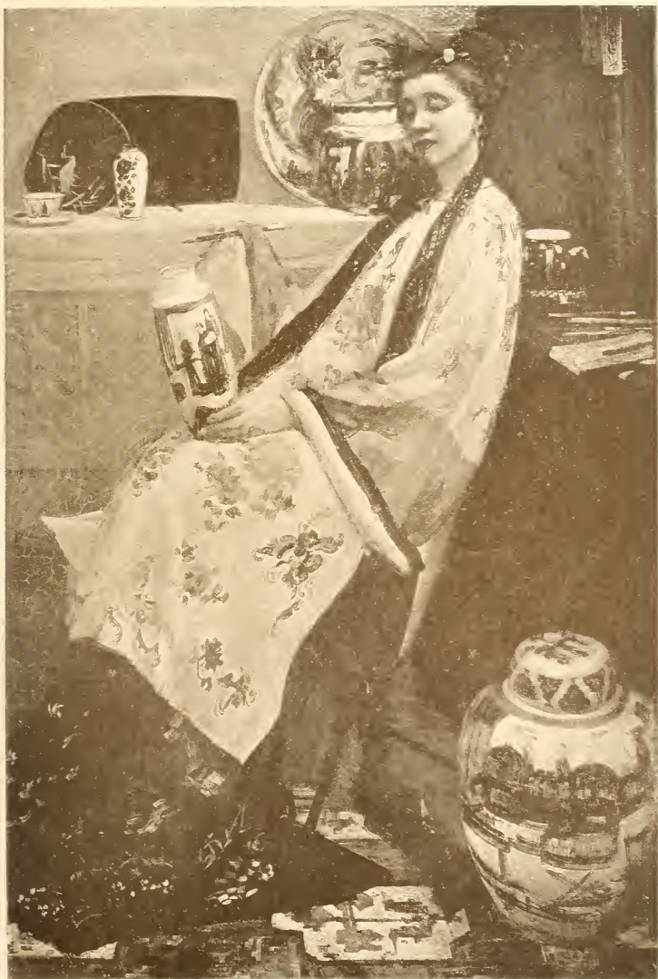
DIE LANGE LEIZEN, OF THE SIX MARKS.